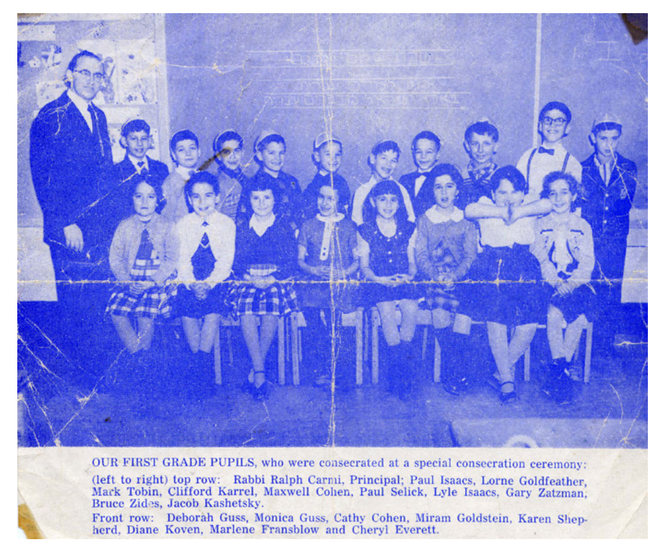
A Hebrew school class pictured in a 1950s newsletter.

Another example, from October 1, 1967, reads as follows: