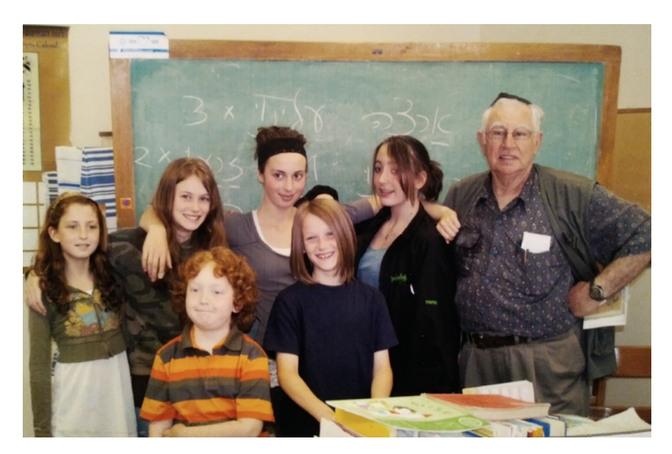
A Saint John Hebrew school class, circa 2010.

Congregation Shaarei Zedek newsletters kept members updated about the Hebrew school. In the 1950s and 1960s newsletters were produced monthly; by the 1980s two to four issues appeared each year. Aside from announcements for forthcoming bar mitzvah celebrations, the newsletter advised of the days and times classes were held, offered suggestions of how to prepare their children for class, and published invitations to special events.