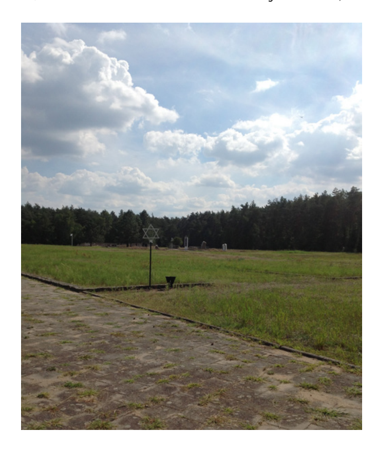
Site of the killing grounds of Chelmno.

Immersing in "the ruins of memory," to use Ida Fink's evocative phrase, is difficult. What were some of the most powerful challenges for you? How did you deal with them?