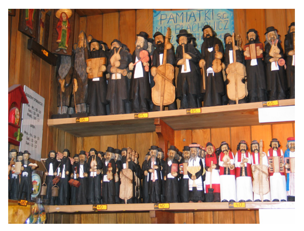
Jewish figurines for sale at the central square marketplace in Kraków. Some have slots for coins.

In retrospect, I think that at the time I viewed the experiences in Kraków like points on a scale of violence, with the obscenity of the figurines and the seemingly "harmless" reproduction of stereotypes on one end, and Auschwitz as a possible outcome of "stereotypization" on the other. But it became very clear to me that this scale was and is not in the past, but reaches our present, and that the whole scale is violent, not just one end.