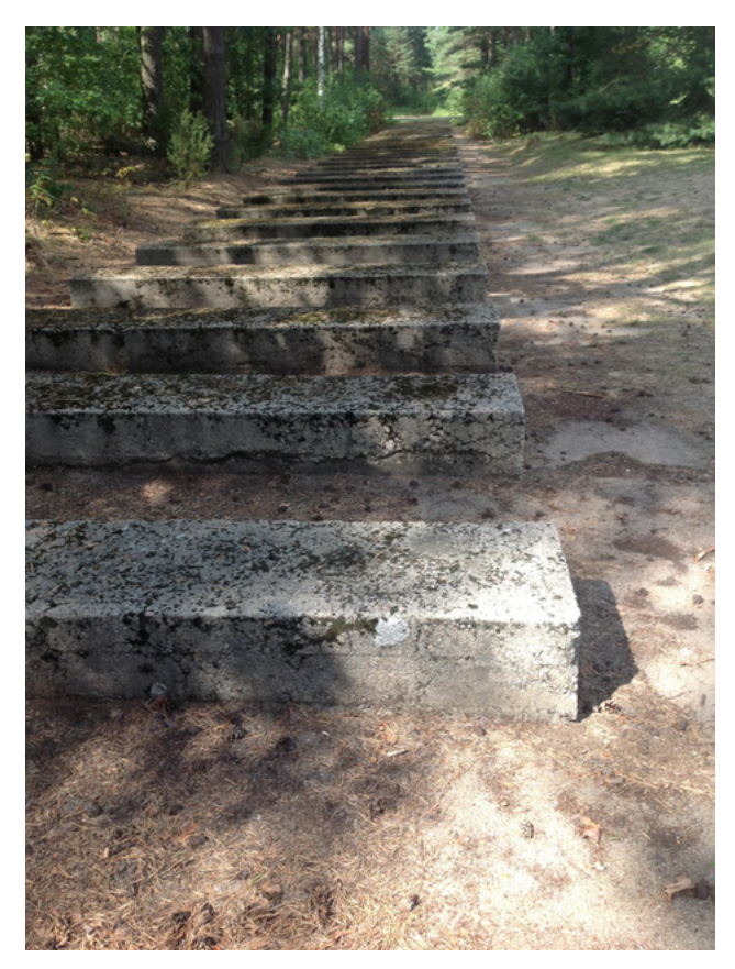
Steps into the woods at Treblinka.

And then there were the sites of former concentration and extermination camps. It wasn't my first time visiting sites of memory. I had been to Buchenwald, Auschwitz, and Sachsenhausen before and spent half a year in Lithuania, where mass shootings during the Nazi time and ghettos like Kaunas were a topic. Yet I was overwhelmed by places like Treblinka, maybe because they were so unlike places like Auschwitz with their museums and things to see. In museums I know how to behave and what to do. What overwhelmed me in Treblinka was that there was so much "free space" (I lack another word for the feeling I had). There were almost no ruins to see and yet so much had happened. The peace of the woods felt humbling and the stark contrast between the atrocities, the many people that were murdered, and the beauty of the forest intensified the impact the place had on me. Having time to wander around and feel that space, that loss of so much and so many, left me thinking for a long time.