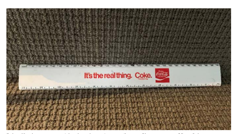
Rulers like these were special and not thrown into pencil cases.

This Coca-Cola chalkboard is in Maureen Solomon's pantry and the grandkids love doodling on it during their visits.