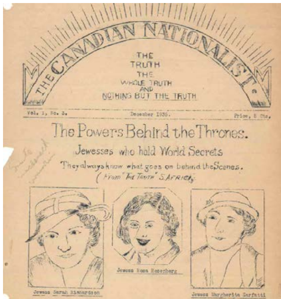
Canadian Nationalist (December 1935) 188