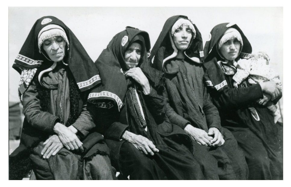
Four Yemenite Women and a Baby in Traditional Dress

1397_021. 1397_001-1397_032.